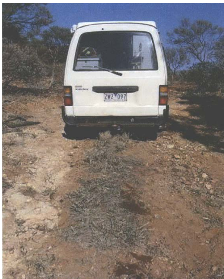
Exhibit 1, tab 26, photograph 6

There was nothing in the van to indicate the deceased's intention once he had made the decision to secure the vehicle and leave, presumably carrying only food and water. His belongings were in the van, including a letter talking about his earlier life which was discovered at a much later date. 28 The presence of his regular medications could indicate an intention to return, his belief he no longer needed them, or complete indifference to his well-being.